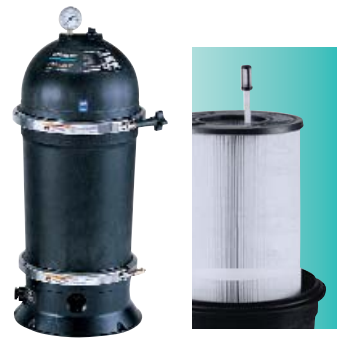
Tough, pleated polyester filter element traps particles as small as 20 microns and provides huge surface area in a very compact unit.