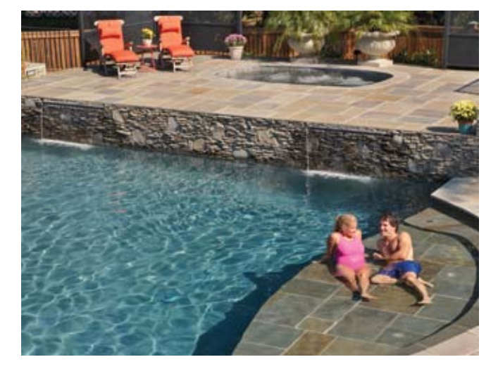
When it comes to moving more water faster and serving multiple features, you can count on Challenger.