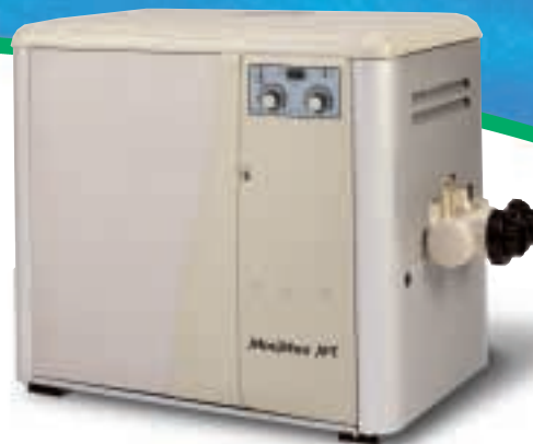
MiniMax NT heater required to heat pool in 24 hours